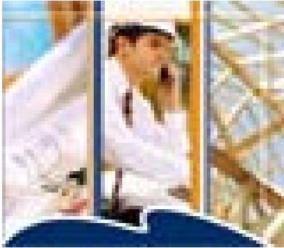
NSW DET project